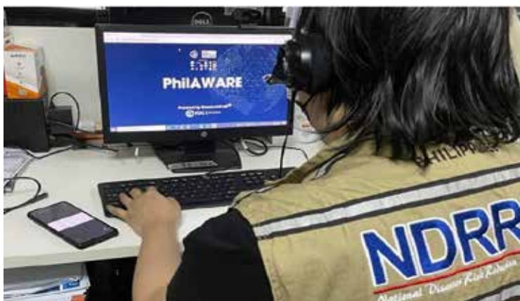
The Philippine NDRRMC (pictured above and right) uses the new PhilAWARE system inside the national Emergency Operations Center to review Super Typhoon Rai impact, response and recovery information.