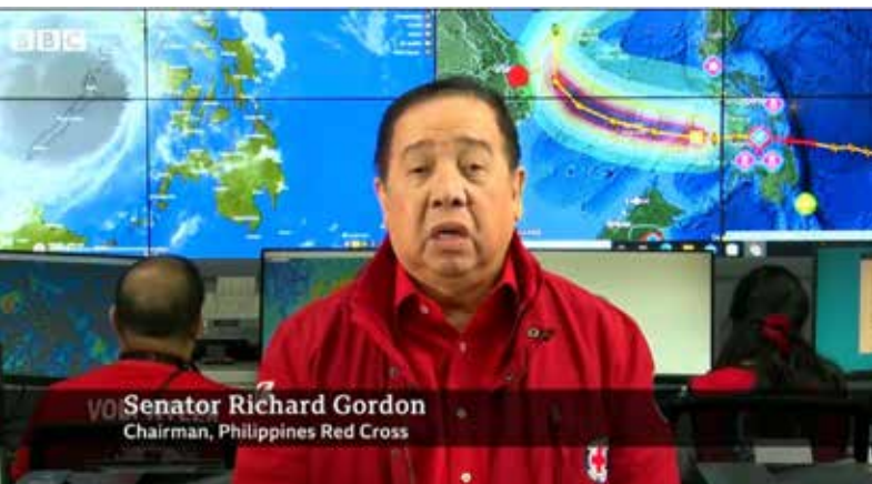
Chairman of the Philippines Red Cross, Senator Richard Gordon, pictured on BBC news with PDC's DisasterAWARE in operational use during Super Typhoon Rai.